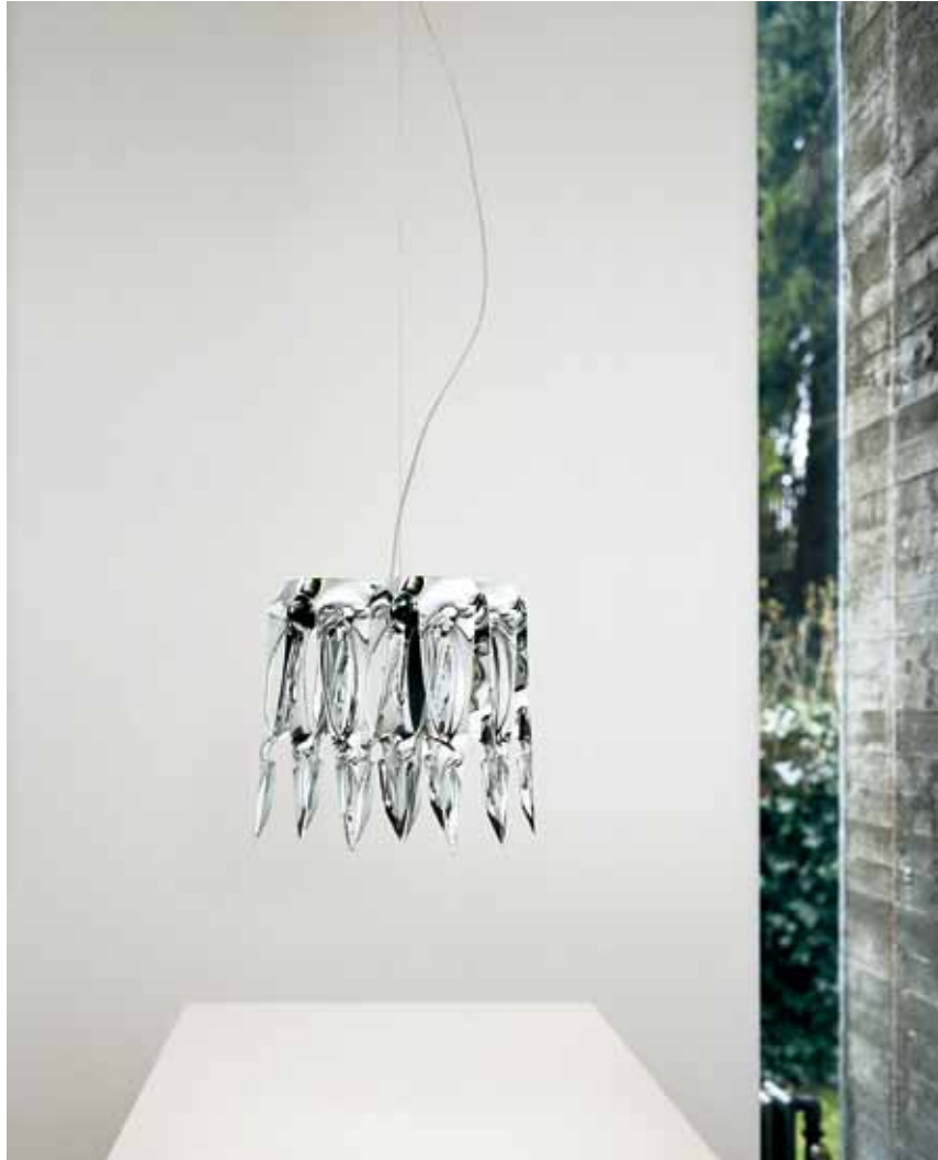
B3 | Always cutting a fine figure: the LQ chandelier by Hani Rashid impresses as a 4-module unit, but can also be assembled into larger units.