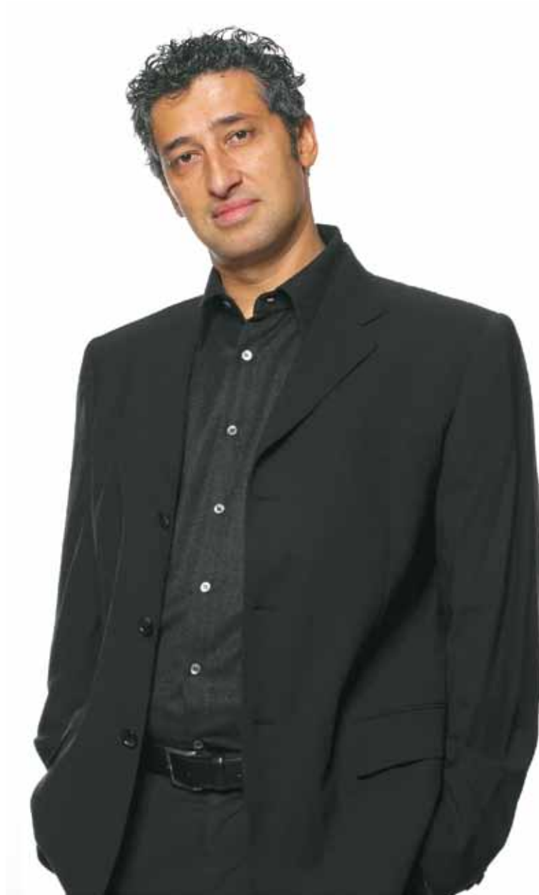
B2 | American architect and artist Hani Rashid.